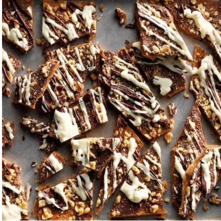
Three-Chip English Toffee Yield: approx. 2-1/2 lbs