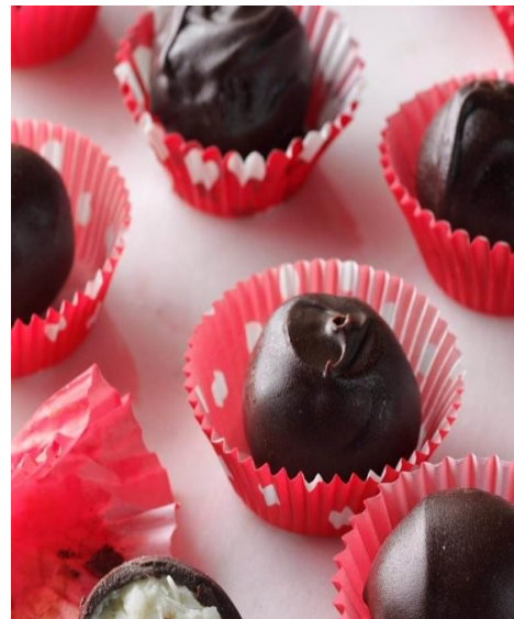
Mounds Balls Yield: approx. 7 doz.