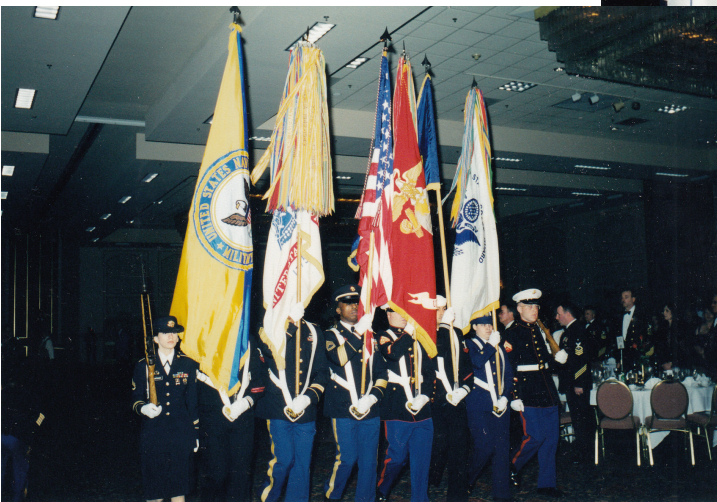
Military Honor Guard