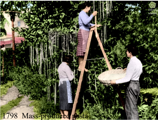
1798 Mass-produced pasta

April 1, 1957 Spaghetti hoax The BBC aired a fake three-minute report showing a family in southern Switzerland harvesting spaghetti from the family "spaghetti tree."