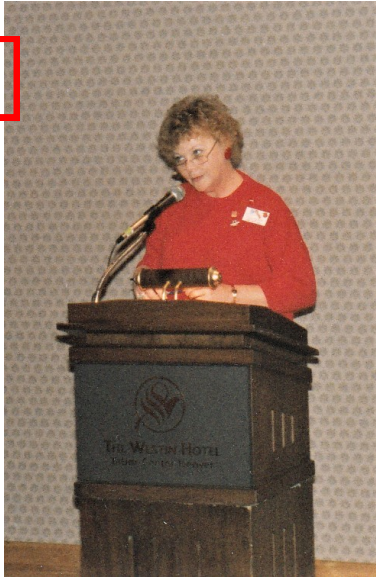
?, Western Regional, Denver 1987