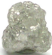
Raw, uncut and unpolished diamonds