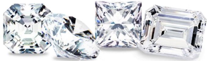
Cut and polished diamonds